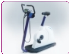
Interfaces with Ergoline and Lode Ergometers