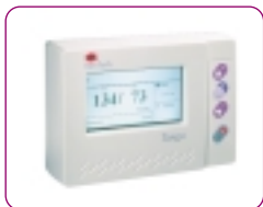
Suntech Tango Motion-Tolerant Blood Pressure Monitor