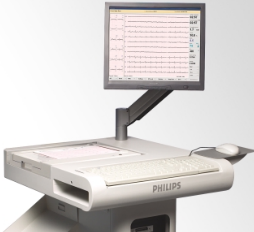
Philips StressVue Exercise Stress Testing System