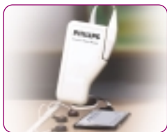
StressVue Patient Module

Available in English, French, German, Spanish and Italian, StressVue is a global stress testing solution.