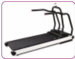
Interfaces with TrackMaster TMX425 Treadmill or Ergometer