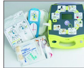
CPR-D•padz come complete with rescue essentials including a barrier mask, a razor, scissors, disposable gloves, and a towelette.

ZOLL's new CPR-D•padz protect the electrode elements with a novel design that sacrifices a non-critical element in the electrode to control the corrosion process and allow an unmatched four-year AED electrode life. ZOLL's CPR-D•padz reduce electrode replacement costs, facilitate AED readiness and maintenance, and decrease the probability of an AED's failure due to electrode expiration.