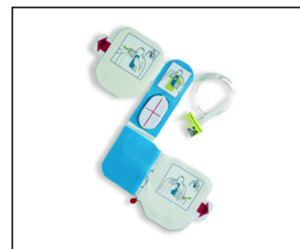
CPR-D•padz offer clear anatomical placement illustrations and a CPR hand-positioning landmark.

The unique one-piece design of ZOLL's CPR-D•padz addresses these problems by orienting the simple design to the head while using the easily remembered CPR landmark (the sternum) as the key placement cue. Packaging is then removed by a simple pull after positioning. Because this is the same placement taught for CPR hand position, AED users benefit from having to remember only one easy landmark for both interventions.