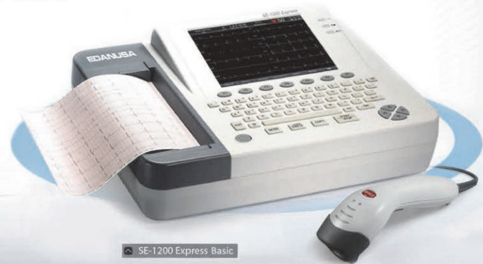
SE-1200 Express Basic