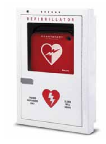
Premium Semi-recessed Cabinet Item # PFE7023D