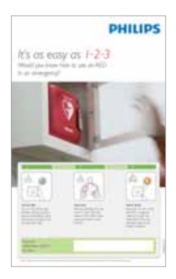
AED Awareness Poster Pack Item # 861476 Opt. ABA (English) Opt. ABE (Spanish) Opt. ABF (French)

Place these posters away from the AED, in break areas, copy rooms or locker rooms – anywhere that employees or members of the public can take a moment to raise their awareness about AEDs. Includes space for the AED coordinator to write-in the location of the nearest AED. Pack of four posters.