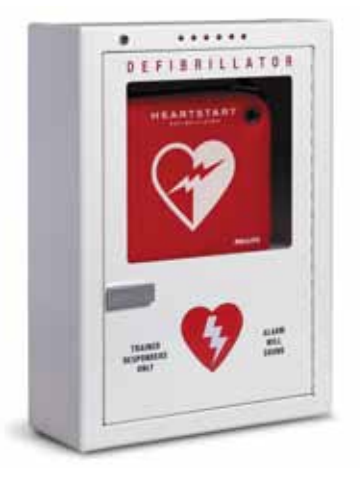
Premium Surface Mounted Cabinet Item # PFE7024D

16.5" (42 cm) w, 15" (38 cm) h, 6" (15 cm) d